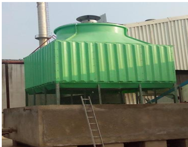
Figure 1.2 – Fluidized bed cooling tower