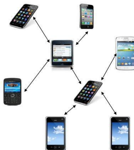
Fig 1: MANET Network

A portable impromptu organization (MANET) comprises of a bunch of versatile hosts that realize how to speak with one another without the assistance of base stations As displayed in Fig. 1, the geography of a MANET can be very powerful because of the portability of versatile hubs The development of portable registering and specialized gadgets (e.g., mobile phones, workstations, individual computerized partners) is driving another adjustment of our data culture. Remote organizations comprise of various hubs which convey by one another over a remote channel. There are presently two varieties of portable remote organizations: framework organizations and foundation less organizations. The framework networks are the one, where cell phones speak with base stations that are associated with fixed organization foundation. Every hub in the foundation networks is inside the scope of a fixed passage like base station Infrastructure less remote organizations is a significant class of remote organizations that is most prominent suitable for situations where there is request of transitory and restricted media transmission interest. Such organizations comprise of remote gadgets that can frame an organization alone without the requirement for pre-sent telecom frameworks, for example, base-stations and passages