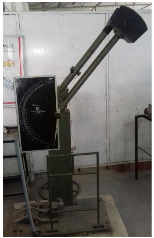
Fig-Impact testing machine

In this test the components are subjected to Impact (Shock) loads, these loads are applied suddenly. The stress induced in these are performed to asses shock absorbing capacity of materials subjected to suddenly applied loads. These capabilities are expressed in form of Rapture energy, Impact strength, & Modulus of rapture. Two types of Impact test are commonly used i.e. Charpy test and Izod Test. In presence work only perform Charpy test.