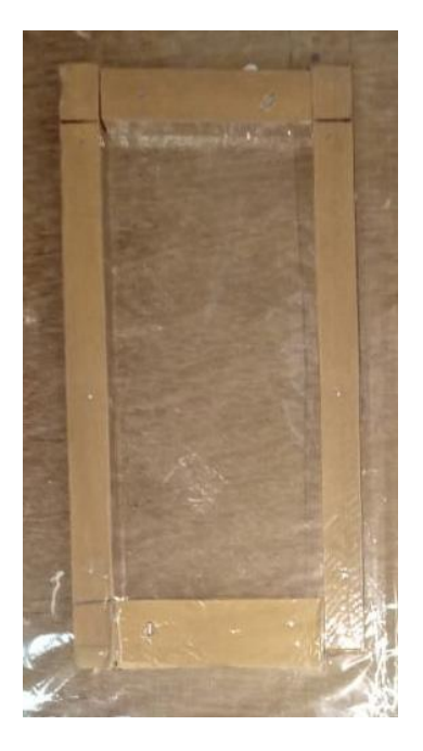
Fig- Preparation of mold

In the present study the dimension of the mould used to prepare specimen for tensile and flexural testing is 150mm×65mm×8mm. At first wooden bits (of thickness 8.0mm) were cut according to the dimension of 150mm and 65mm respectively. Then these wooden bits were wrapped with plastic tape. A flat wooden board fixed with a transparent plastic sheet was used to form the base of the mold. The wrapped wooden bits were fixed firmly (with the help of nails) in rectangular shape as shown in figure. The purpose of the transparent plastic sheet is to prevent sticking of the mixture and ease removal of the specimen after room temperature curing.