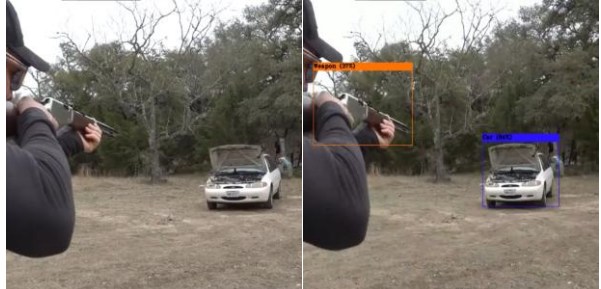
Figure 3: Before and after we ran our project.

We executed our program on various videos and images which are displayed the respective results from Fig 3 - Fig 6