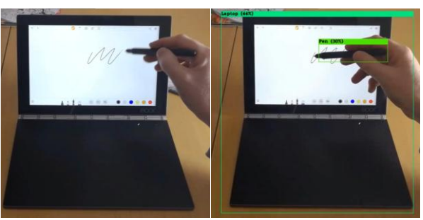
Figure 5: Before and after we ran our project.