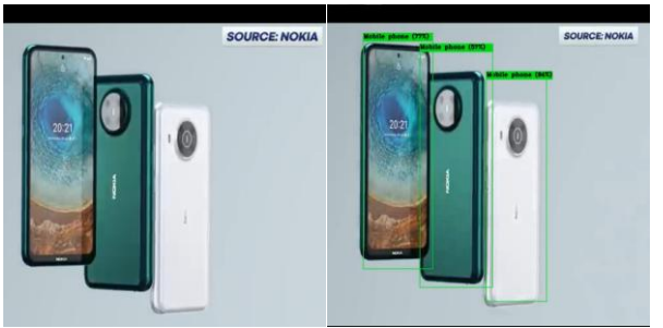
Figure 4: Before and after we ran our project.