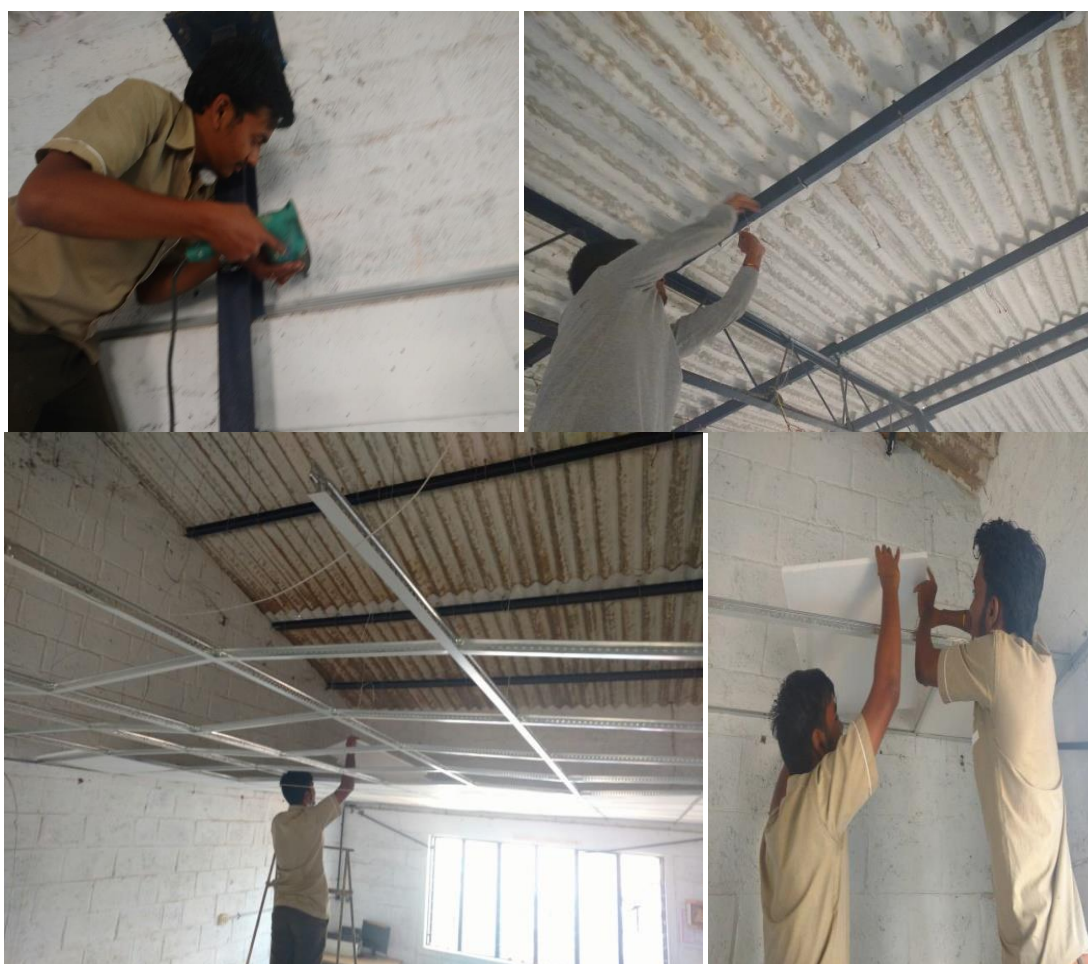
Figure 3: Construction Process - Installation of EPS False Ceiling

Finally, EPS have low weight, excellent mechanical resistance properties, a better alternative for load-bearing roof insulation and road construction. Ngugi et al. , (2017) suggested that EPS's chemical resistance make it completely compatible with other materials used in construction including cements, plasters, salt, fresh water and admixtures and its versatility would result in an easy cut into the shape or size required by the construction project. Also, EPS is unaltered by external agents like fungi or parasites as they find no nutritional value in the material. EPS is 100% recyclable and thousands of tonnes are recycled every year in developed countries like the United Kingdom (UK). Sulong et al. , (2019) reviewed that in Norway, usage of EPS geofoam as backfilling has prevented the gradual sinking of bridge deck by reducing the load applied to the weak foundation.