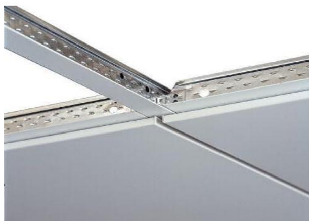
Figure 2: Stainless Steel Galvanised T Grid Ceiling. 13

After locating the exact position for the suspended ceiling, a level was used to draw a line completely around the room indicating where the wall angle will be applied. A level for accuracy of the original ceiling level was analyzed and the wall angle was set low enough to conceal pipe ducts and therefore after measuring