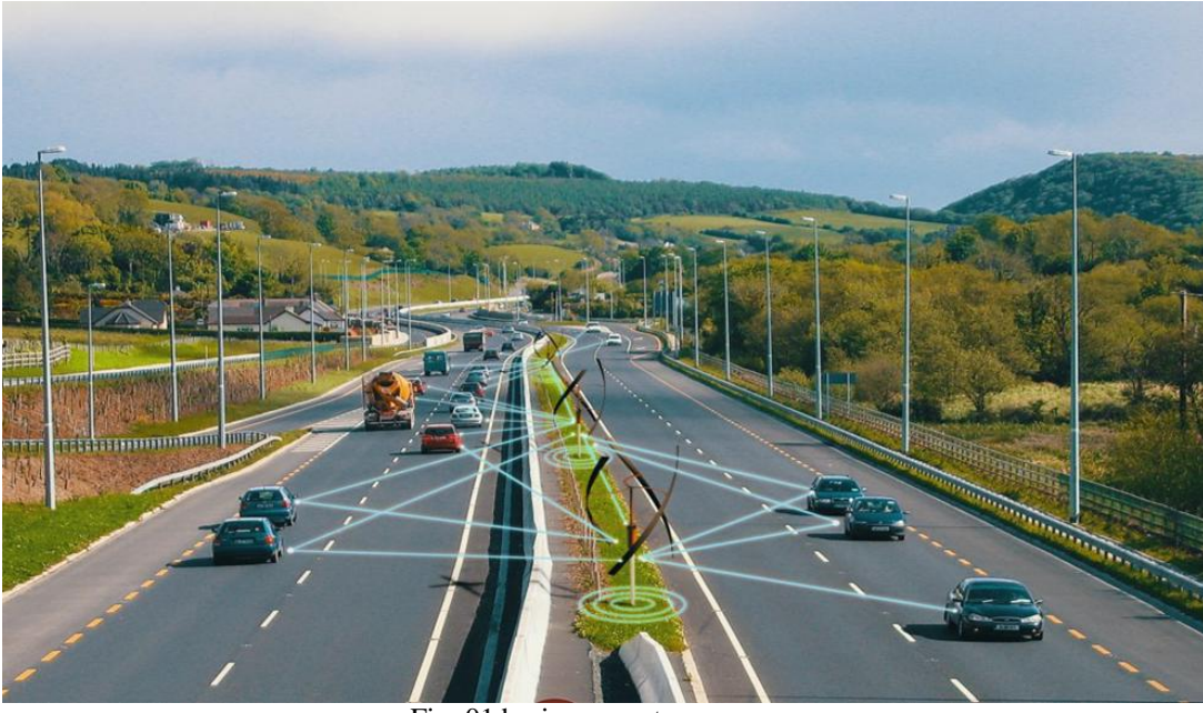
Fig. 01 basic concept