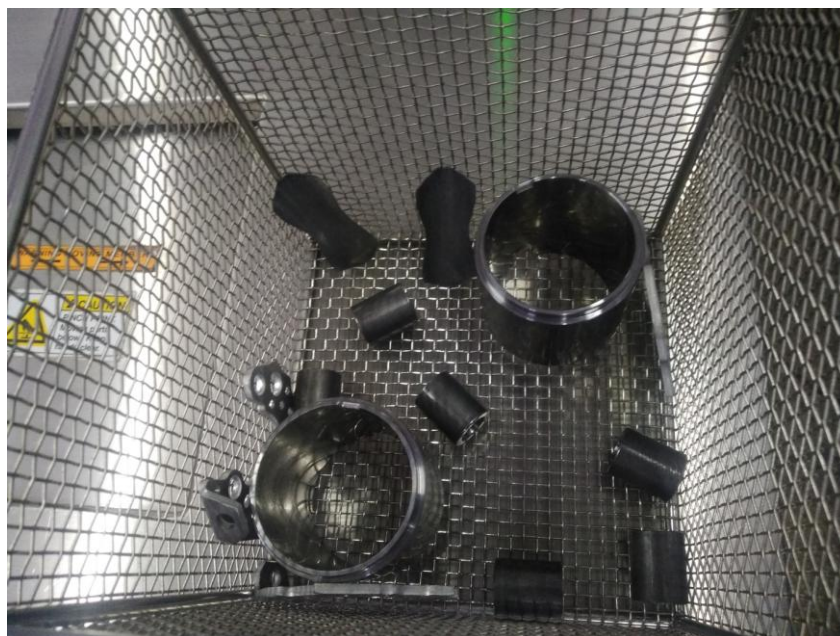
Image-4, Cleaned Components