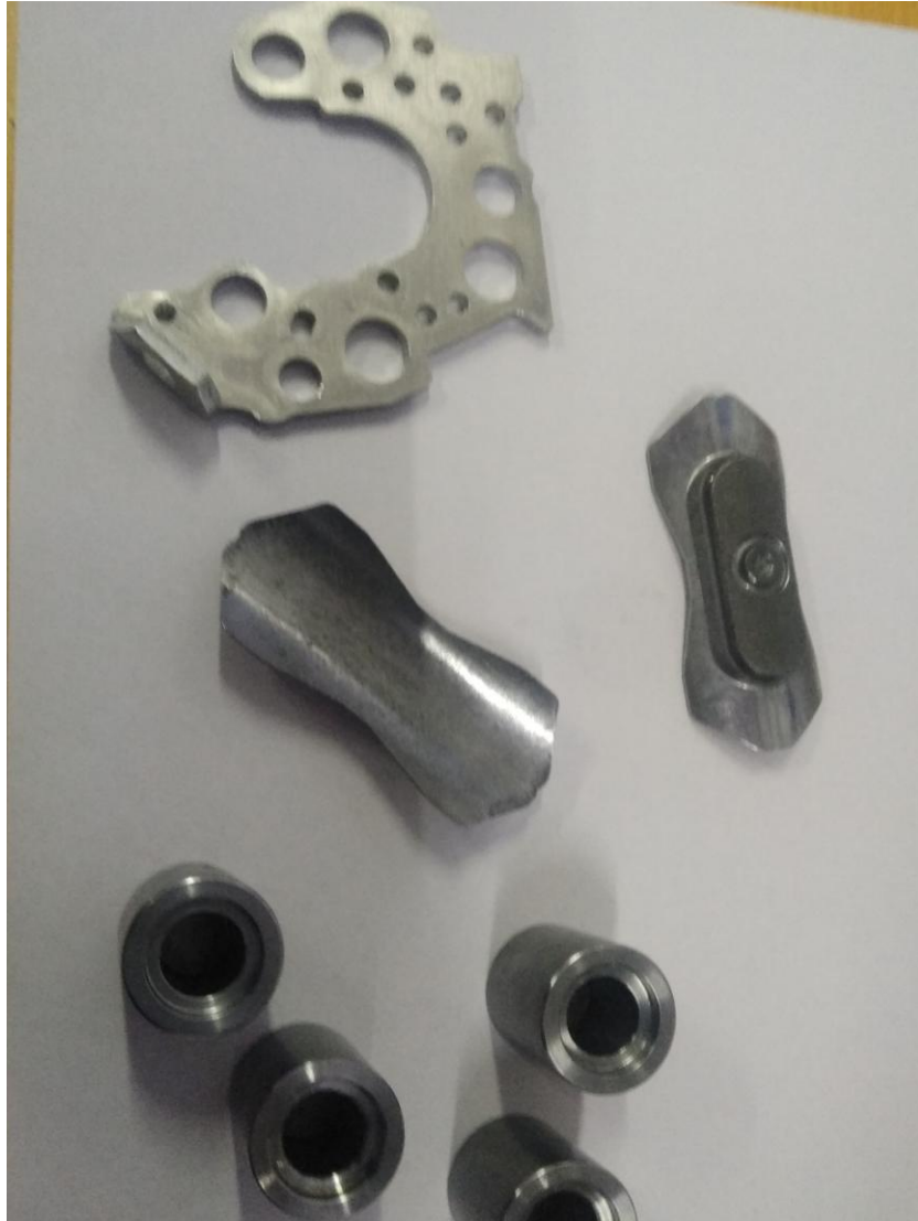
Image-3, Cleaned Components