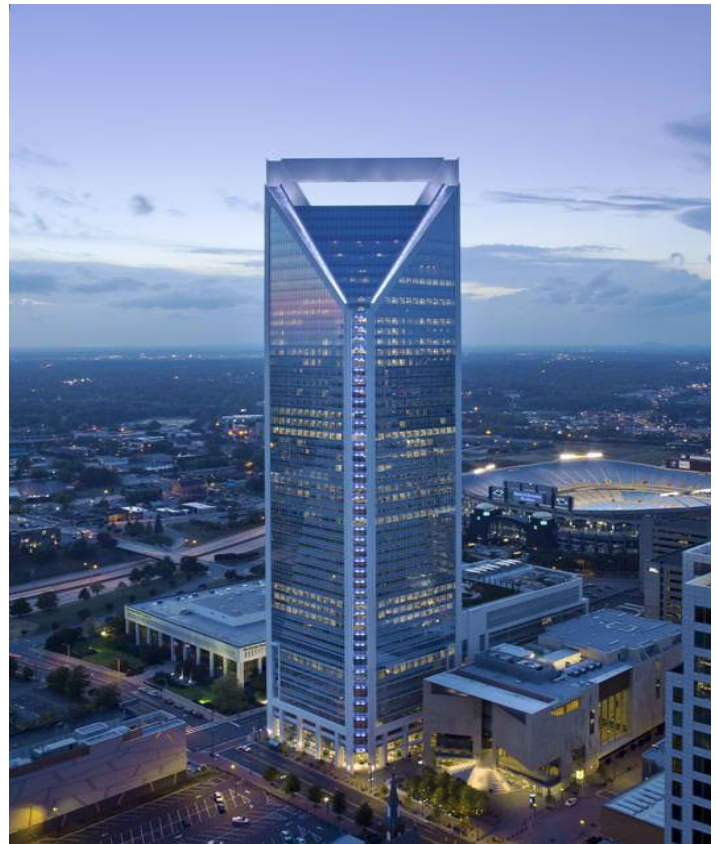
Figure 6. Duke Energy Center, Charlotte, NC