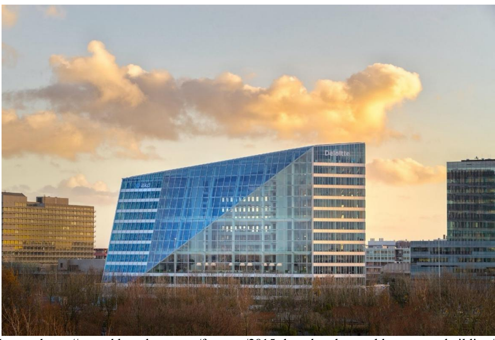
Figure 9. The Edge of Amsterdam.

The building shown in Figure 9 is dubbed as the "Smartest Building in the World" by Bloomberg. The smartphone app is used in optimizing the efficiency and productivity of its employees. It can automatically direct employees to an open parking spot for their cars, direct them to an open workstation, and the app knows the employees' preferences in terms of light and temperature then the environment performs accordingly. Apart from that, it has the world's most efficient aquifer thermal energy storage system. The Edge is known as the greenest building globally, with a rating of 98.4%, the highest sustainability score ever awarded by the British rating agency BREEAM [11, 15].