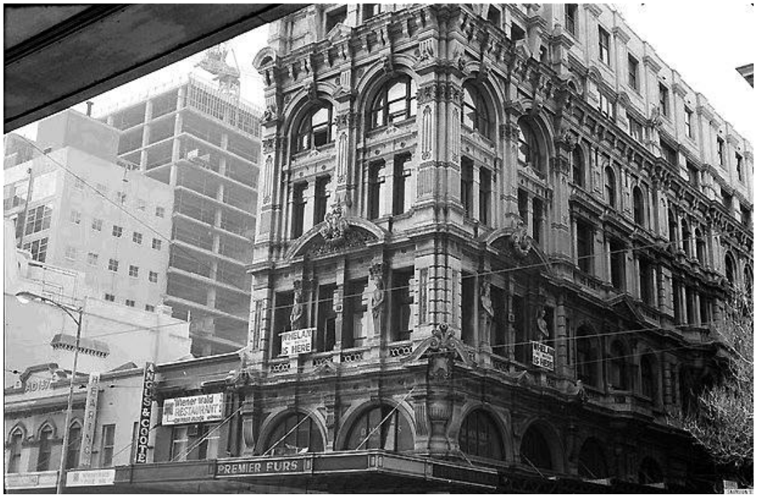
Figure 1. Melbourne Town Hall Chamber, 1968.

To take a brief glimpse of the first buildings, these are constructed as a primitive shelter made from the combination of natural materials such as stones, wood, sticks, animal skins, to mention a few. These early structures, such as in Figure 1, have the same purpose as the buildings we see today. However, they hardly resemble the steel and glass which were used as materials, that is, to provide comfortable space for people staying inside. On the other hand, today's buildings are built with the concatenation of complex structures, systems, and technology. And as we enter the age of modernization, buildings' components are being enhanced with innovative lightings, security, heating, and ventilation, to mention a few [4]. However, upon considering the impact of buildings on the electrical grid, environment, and organizations' mission, building owners weren't satisfied with the concept of their buildings that were only able to provide comfort, light, and safety. This challenge triggered the emergence of the smart building.