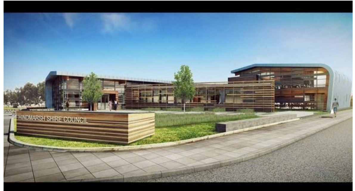
Figure 5. Hindmarsh Shire Council

The Hindmarsh Shire Council Corporate, shown in Figure 5, is a known smart building in the world located in Australia. Melbourne-based architect firm k20 Architecture's main objective is to improve energy efficiency while enhancing the office environment for employees. The architects took advantage of the building's location, where it is exposed to extreme temperature conditions, by building a series of underground thermal chambers and a ventilation system under the floor in to draw in fresh air from the exterior [6].