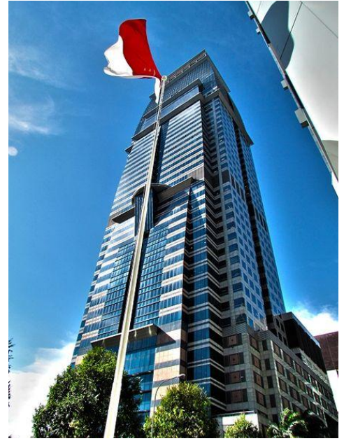
Figure 4. Capital Tower of Singapore

This 52-story office building shown in Figure 4 won the Green Mark Platinum Award for its construction and design, along with its energy and water efficiency [6]. The Capital Tower is composed of several built-in energy-efficient systems such as an energy wheel recovery system in its air-conditioning unit, motion detectors, double glazed glass windows, etc. In addition to that, this 68 000 square-foot building has few amenities, which include a sky lobby, a fitness center, pool, childcare, and dining options.