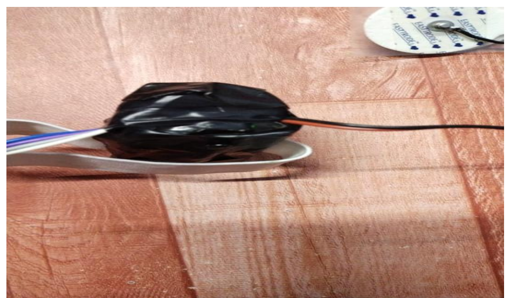
4.1 Device with temperature sensor probe