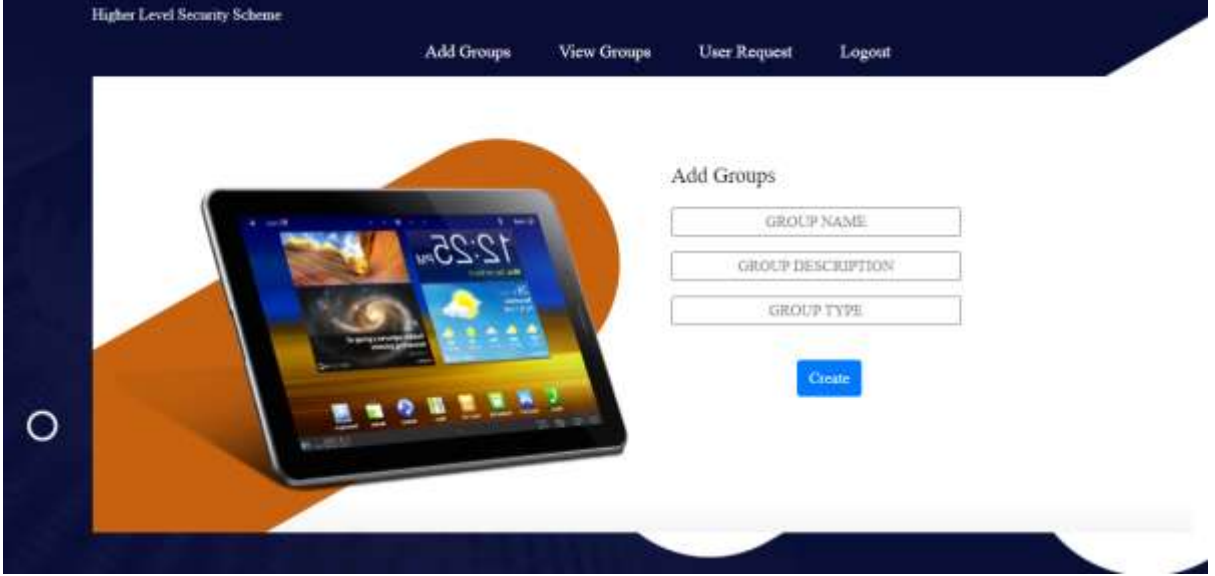
Fig: Add Groups