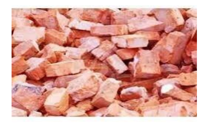
Fig,4 Brick Bats