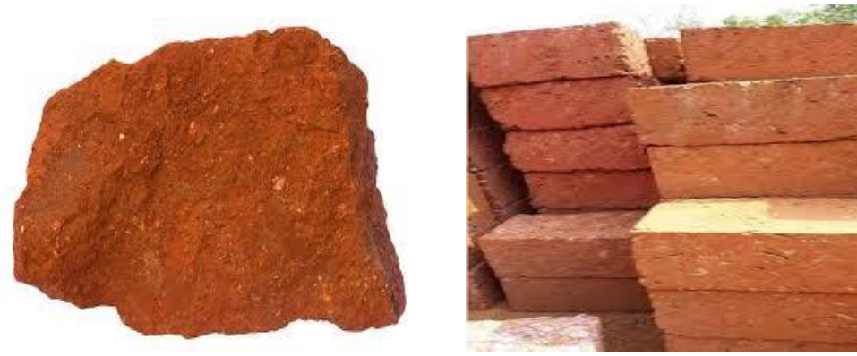
Fig.2 Laterite Stone