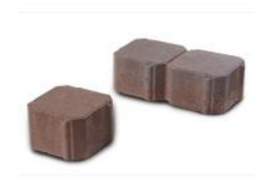
Figure 2: The outlook of the permeable bricks

With environmentally conscientiousness or simply being a fan of LID – low impact development, then the permeable pavers might be the right choice for mega events', like Beijing Olympics and Beijing Garden Expo spots. Ideal's permeable pavers offer an environmentally-beneficial pavement designed specifically to reduce storm water runoff, while offering beauty and structural strength for driveways, patios and walkways. The permeable pavers are designed with a notch in the sides so that when they are installed, a series of funnel-shaped openings are created that allow rain to drain through the pavement surface and infiltrate into the ground.