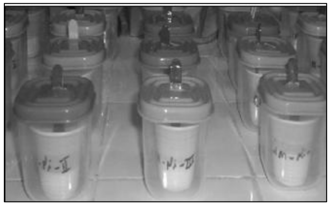
Figure 2: test specimens

The equipment used in the leaching experiments consisted of plastic containers of 200 mL containing the test specimens fully immersed in the leaching solution. The preparation of the test specimens was carried out with 40 g of white commercial cement contaminated by the addition of 1 g of one of the salts containing a contaminant element (copper sulfate, potassium chromate, cadmium chloride or nickel chloride) and 10 mL of demineralized water, as Fig. 2, below, shows: