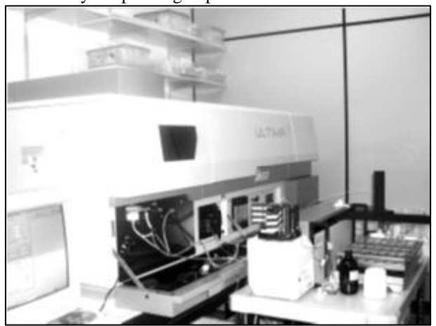
Figure 3: Optical emission spectrometer with inductively coupled argon plasma

After the time limits established for the leaching operation, samples were taken from the leaching solutions in glass flasks suitable for spectrometer sampling and sent to be analyzed by emission spectrometry with inductively coupled argon plasma to quantify the leached contaminants. Fig. 3, below, shows the optical emission spectrometer with inductively coupled argon plasma.