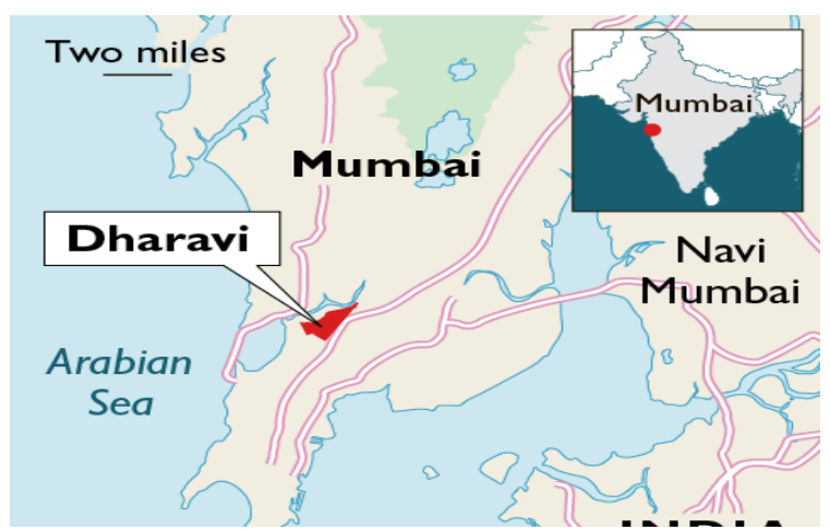
Location of Dharavi in Mumbai

Dharavi followed the same migration pattern as of Mumbai over last three decades. The vast growth of population transformed Dharavi into the largest slum of Asia. However, many thriving communities of diverse cultural, linguistic and religious background are the residents of Dharavi, such as the potters' cluster by the artisans from Gujarat, leather tannery by the Muslim tanners from Tamil Nadu, garment shops by the embroidery workers from Uttar Pradesh, etc. Today, Dharavi is the home to about 900,000 people, over some 535 acres of land, owned by Government of Maharashtra (GOM). These informal settlements of drifting communities have contributed extremely to the financial growth of Mumbai over the years, in spite of the lack of appropriate housing, fresh water, sanitation and other basic services.