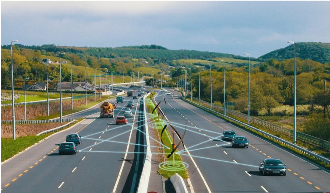
Fig. 01 basic concept