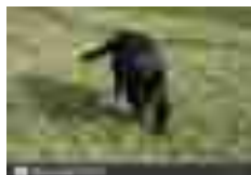
(Test image) Caption -> The black cat is walking on grass

Now, let's say we use the first two images and their captions to train the model and the third image to test our model.