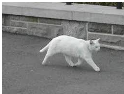
(Train image 2) Caption -> The white cat is walking on road (Train image 2) Caption -> The white cat is walking on road