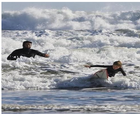
A couple of individuals riding waves on top of boards.