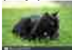
(Train image 1) Caption -> The black cat sat on grass

Consider we have 3 images and their 3 corresponding captions as follows: