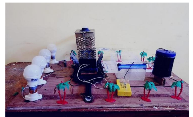
Figure2: Working Model of Electricity Generate by Waste Material