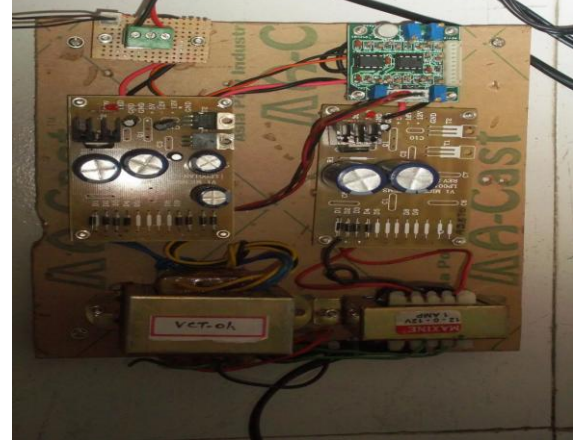
Fig 2 : Controller Display